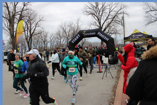
Photo: Time Travelers 5K/10K/Half Marathon January 4th