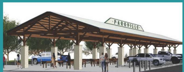
Rendering of new Parkville Farmers Market