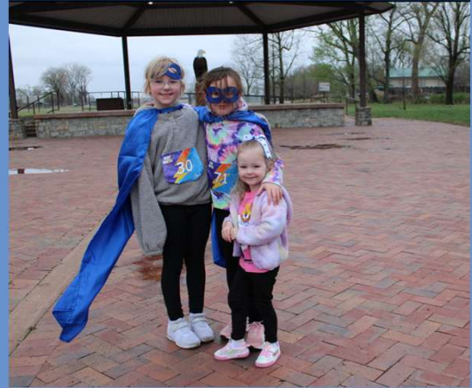
Photo: Hero Hustle 5K on March 30th