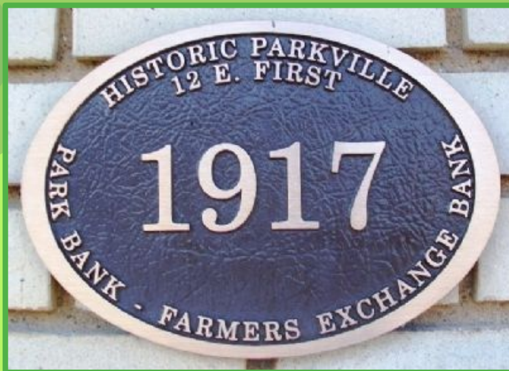
Park Bank - Farmers Exchange Bank