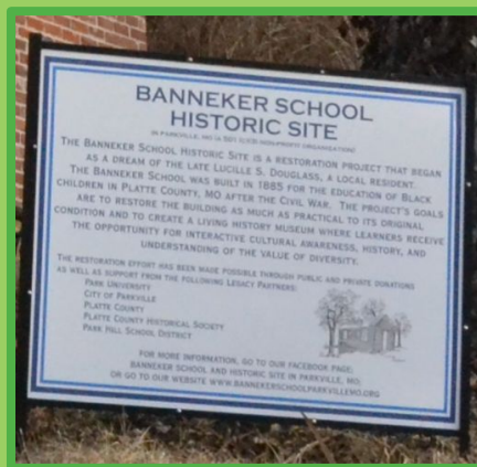
Banneker School - 1885