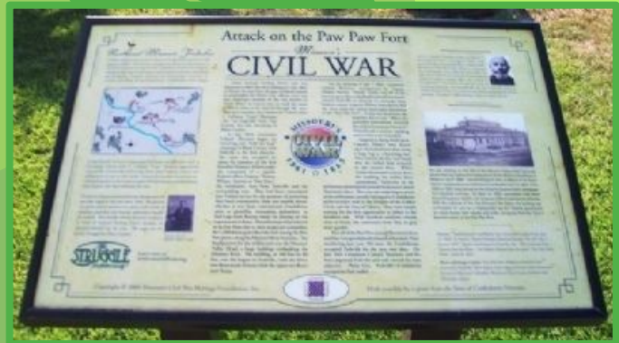
Attack on the Paw Paw Fort Missouri's Civil War 1861 - 1865 Removed